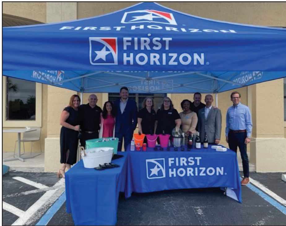
First Horizon Bank had a tent setup outside of its location on A1A as it hosted a St. Johns County Chamber of Commerce Ponte Vedra Beach Division After Hours event April 27.