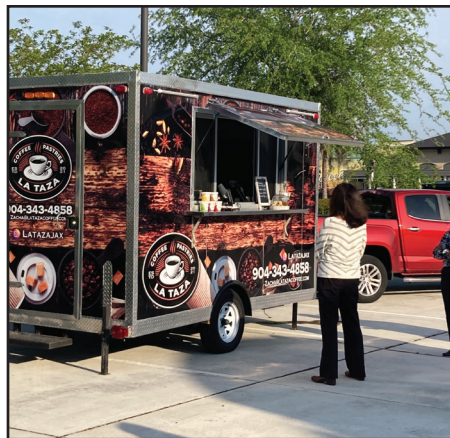
Coffee was available to purchase for those attending the Chamber's Before Hours event April 5.